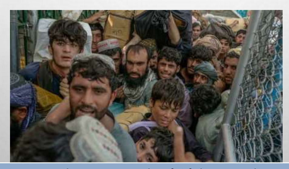
A picture showing struggle of Afghan People